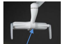
Captor's detection area

NB: LOLe is of low electrical consumption thus it does not emit any heat; it is not necessary to switch it off between each patient.